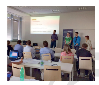
Students teams are prezenting their projects at local Demo day in Prague

"I am open to new ideas, new things and I like to know new contacts, I wanted to participate again in an international cooperation project, to use the university to the maximum."