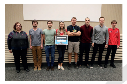
Winners of the 2<sup>nd</sup> Local Demo Day – Traffic Watch