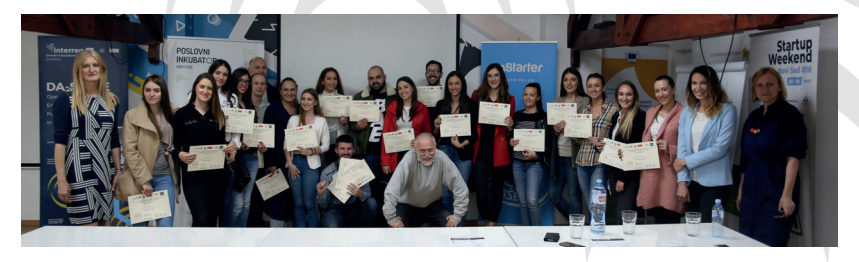
2<sup>nd</sup> Demo Day