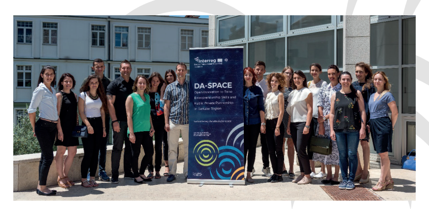
The participants of the first cycle of UNIPU OI Lab

The 1st International Demo Day, as a Mid-Term event, was organized and held in Pula, in June 2018. The event gathered all the project partners and seven winning teams which presented their solutions in front of an international audience.