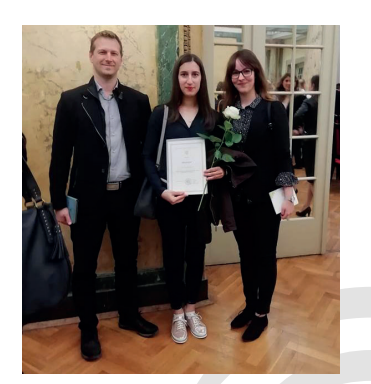
The member of the winning team of the first cycle with a certificate, Juraj Dobrila University's Day