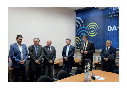
Official opening of the laboratory

DA-SPACE Open Innovation Lab Bulgaria is located in the building of the Faculty of Mechanical Engineering of the Technical University of Sofi a (TUS) – Building number 4 – in the center of the university campus and close to the University Library and the Student Centre. The campus itself is not that close to the city center, but it is easily accessible by bus and subway. The lab's work is supported by GIS Innovative Transfer Centre (Bulgarian Academy of Science). Some facts: Total area = 36 m²; Total working places = 10; Total desktop computers = 6; 55" 3D TV; Internet over LAN and WiFi; Conference table; White board; 3D Printer; Overhead Projector, coffee break facilities.