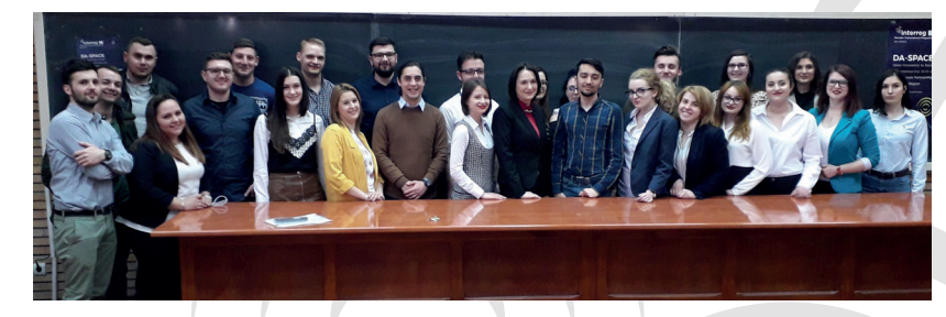
Second Regional Demo Day; solvers, seekers, project teams – together!