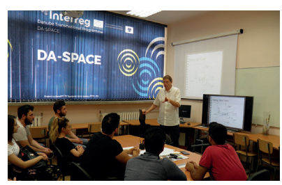
Discussion with Solvers during entrepreneurship training

Basic information, additional information www.interreg-danube.eu/da-space