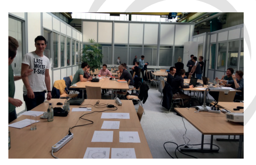
Workshop Day offered by one of the seeker