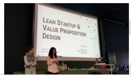
Project Partner BWCON during the Entrepreneurship Training on Lean Startup and Value Proposition Design