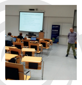
Entrepreneurship training (Business Modelling) 2nd cycl

Joint workshop of the ASP Slovak Energy and Innovation Agency: Project "inovujme. sk!" and IM STU: OI Lab STU in the Project DTP DA-SPACE; transmitted by the TV JOJ (November 2018)